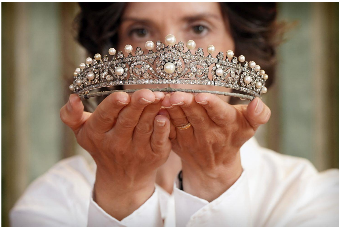
The Airlie Tiara at Lyon & Turnbull